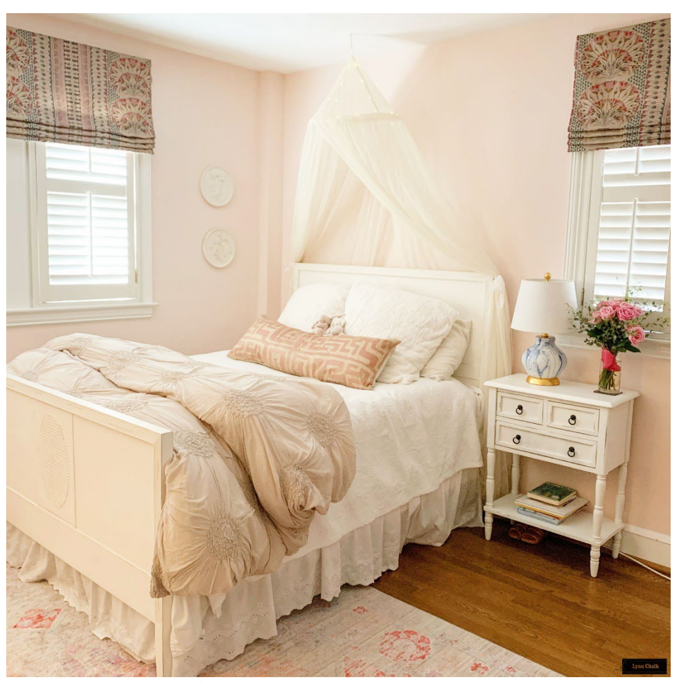
Roman Shade in Thibaut Cairo Pink Coral AF9625