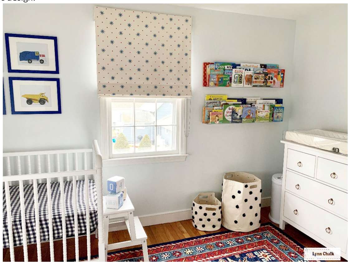
Roman Shades in Sister Parish Serendipity Blue Orange SPF 2500-02

Mounting halfway between top of window and ceiling or crown molding will make the windows feel taller. This also allows more of the roman shade to stack on the wall instead of the glass when the shades are up, allowing more light in during the day and showcasing more of the fabric design.