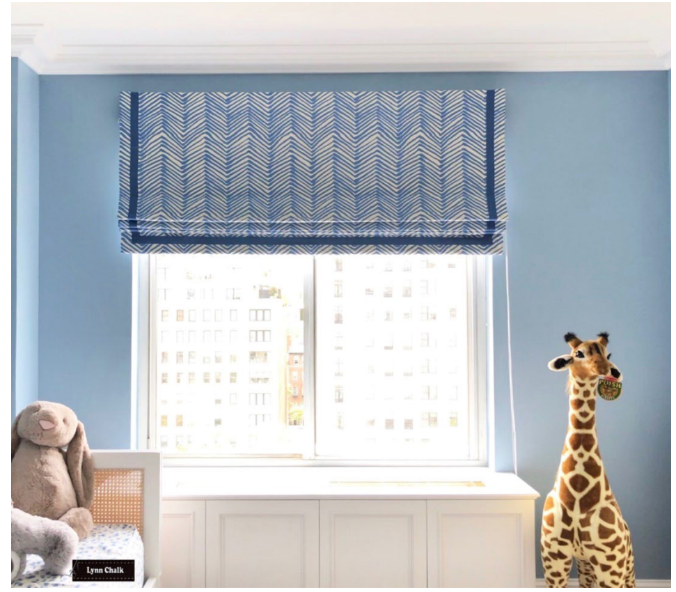
Double Width Roman Shade in Quadrille Zig Zag French Blue on Tint with Samuel & Sons Grosgrain Ribbon Trim in Myrtle. Window has no window casing.